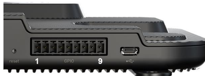
Table 7: Impinj R700 GPIO Electrical Specifications