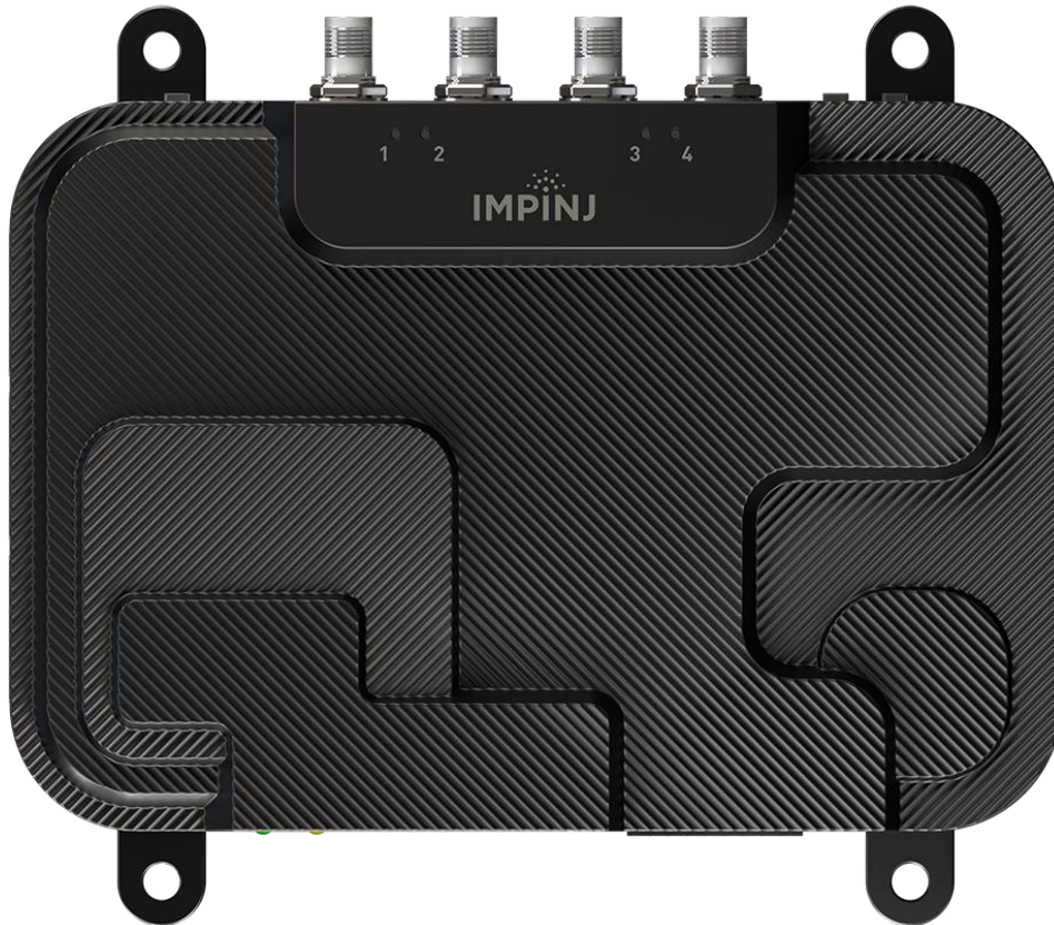
Figure 2: Impinj R700 Bottom View