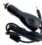
5V3A Car Charge